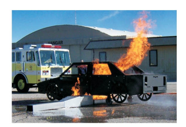
Car FireTrainer® O-100