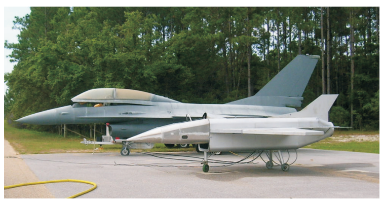
F-16 FireTrainer® O-100