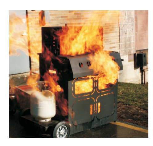
BBQ grill prop