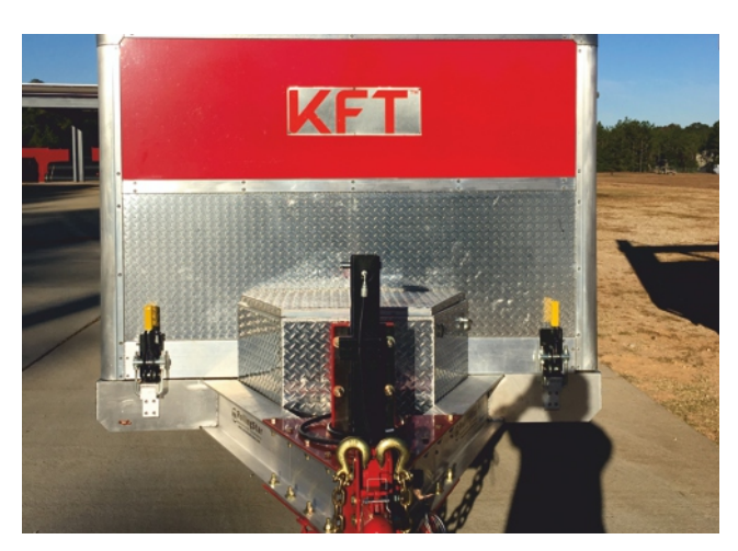
Trailer Front View