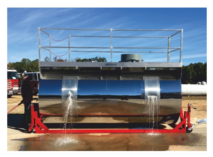
Both Tank Leaks Activated

The currently in use MS-10 HazMat Trainer is useable both on ist trailer truck or in a stationary mode. It features multiple tank leaks, can simulate a tank rollover acccident and has both a chlorine and a gasoline dome leak simulator on board.