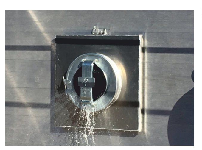
Pressure Relief Valve Leak