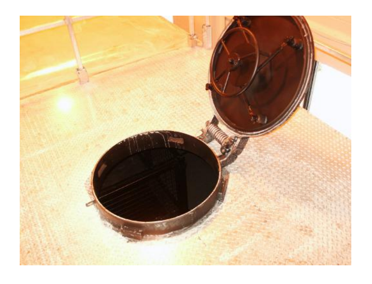
Round Scuttle Leads into 3D Maze