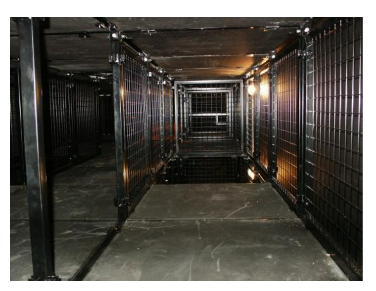
Fully Re-configurable 3D Maze