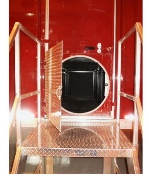
"Doggie Door" Side Entry Hatch