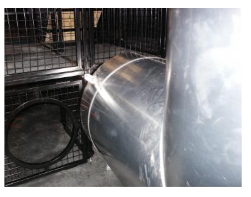
Removable Confined Space Tube Leads Directly Into Maze