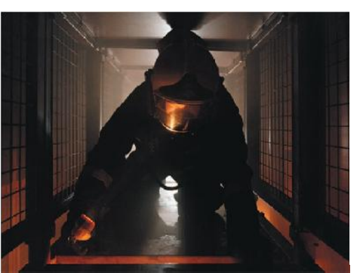
SCBA Training In 3D Maze