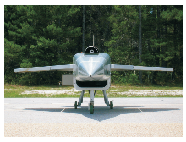
Painted steel construction with removable aluminum nose cone