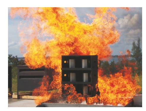
Paint locker prop