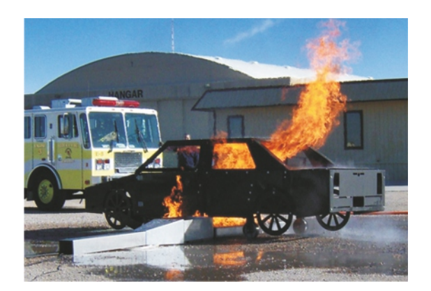
Car FireTrainer® O-100