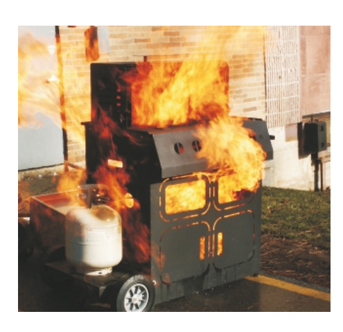
BBQ grill prop