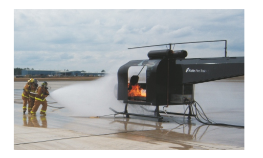
Helicopter FireTrainer® O-100