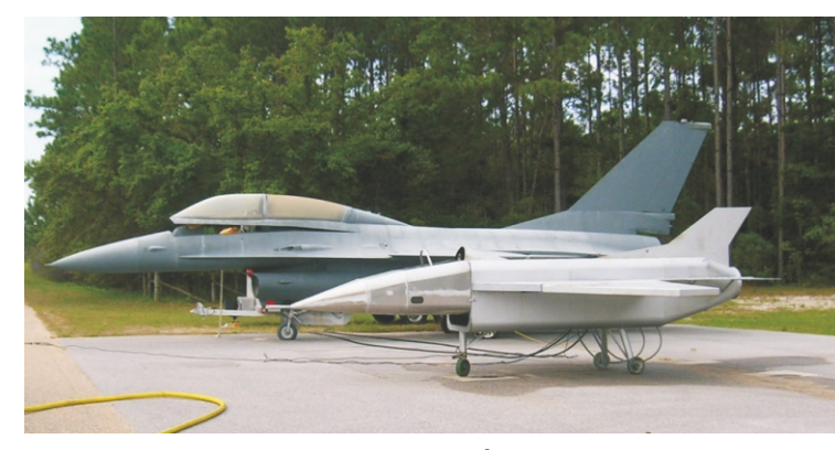
F-16 FireTrainer® O-100