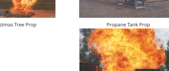
Wireless controls also available!