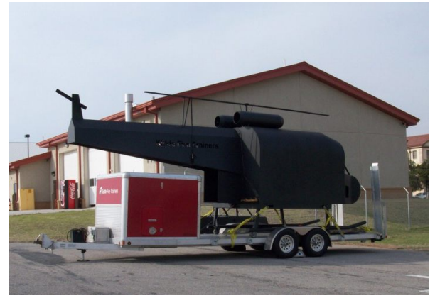
helicopter on trailer with propane tank storage