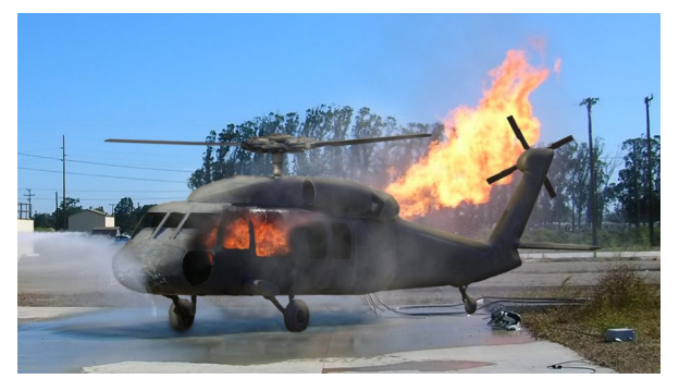
UH-60 Black Hawk and Huey models available