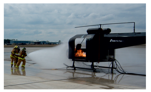
passenger/cargo area fire