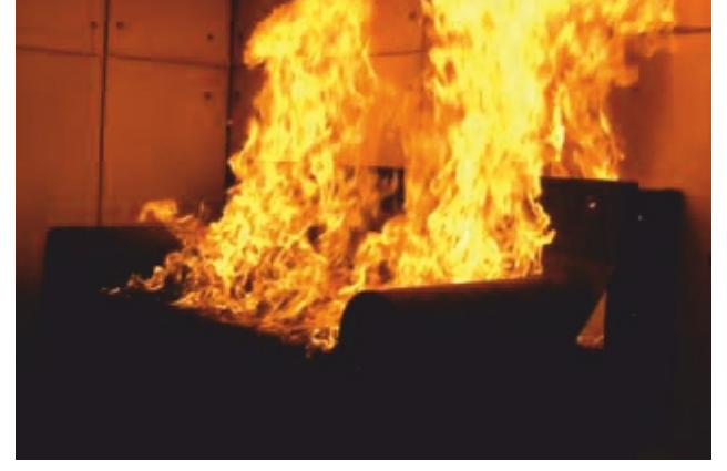
Storage Fire Couch Fire