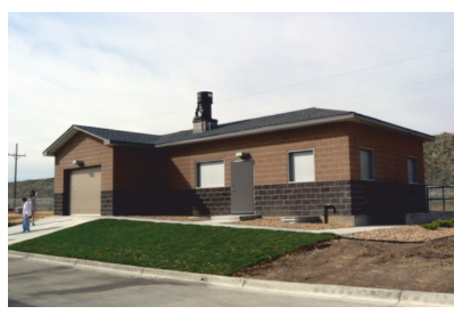
1-Story Residential Building