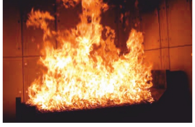
Desk Fire Bed Fire