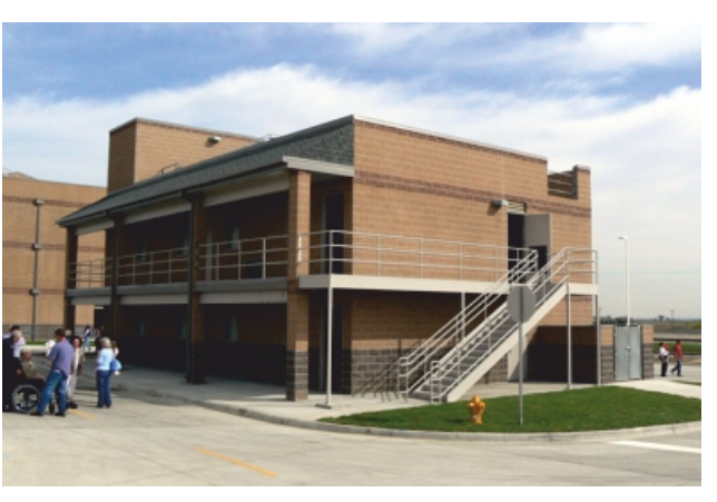
2-Story Apartment Building