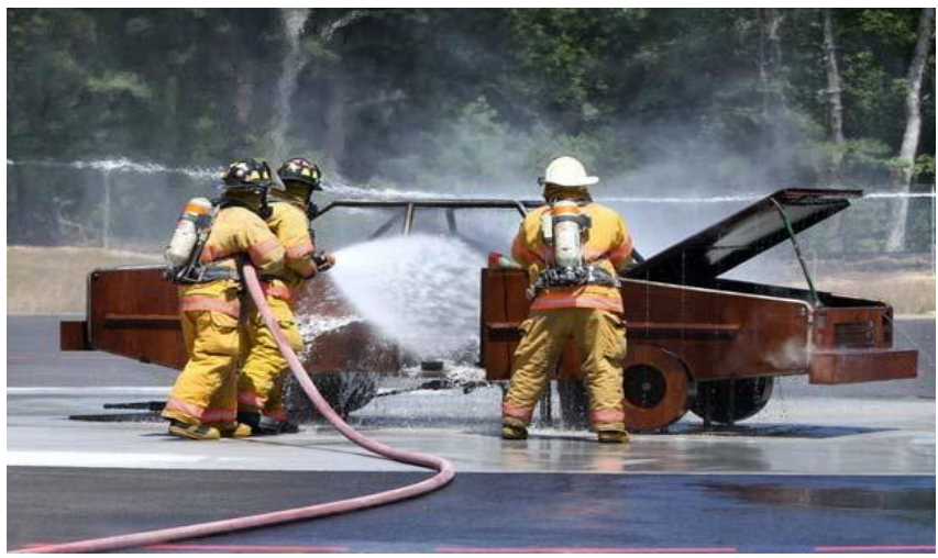
Hope Valley firefighters demonstrate a controlled burn on a demonstration car that is part of the training facility at the new R.I. State Fire Academy, which was shown off to the public today.