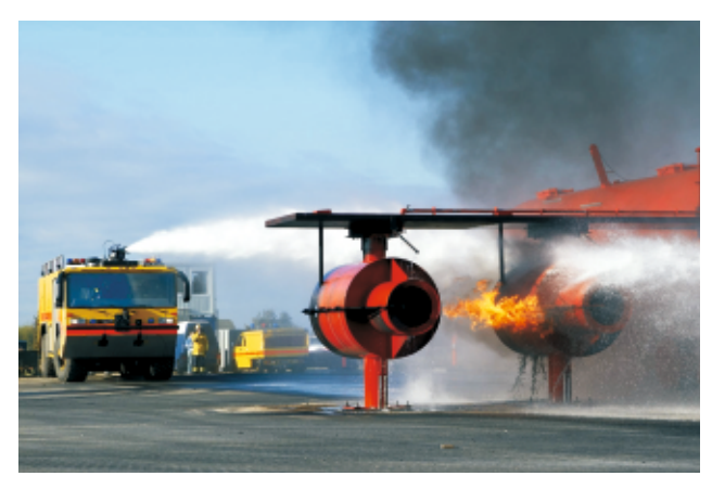
C-130 Jet Engine Fires (2x)