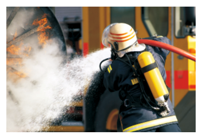
Extinction Training at Engine