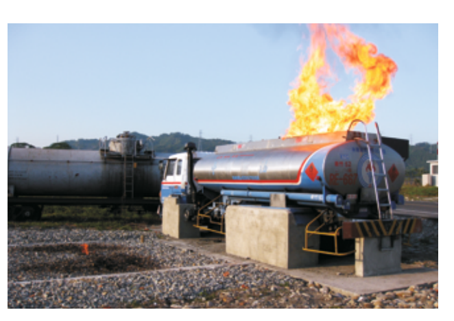
Highway Accident Trainer