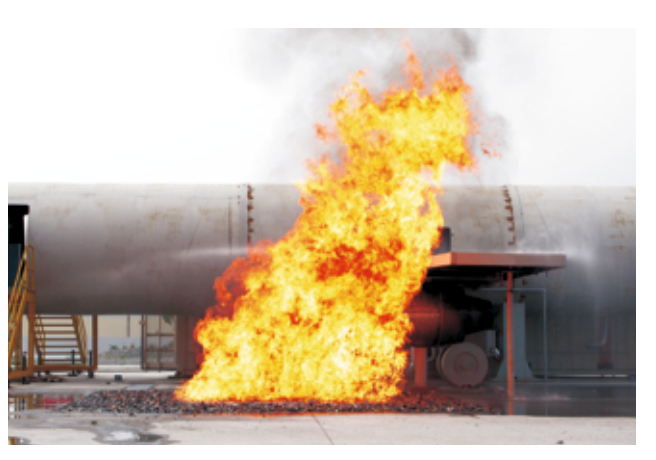
3-D Fuel Spill Fire