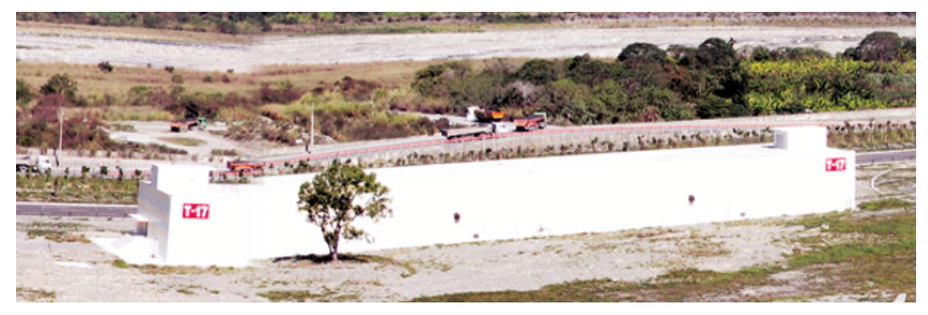
Subway Station Trainer Building