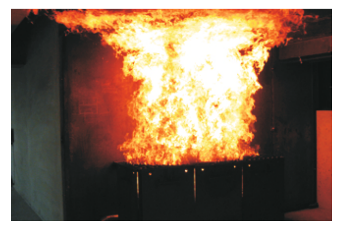
Bar Counter Fire