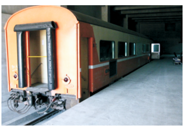
Subway Station Trainer