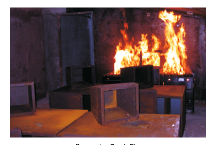
Computer Desk Fire