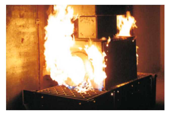
Motor Generator Fire