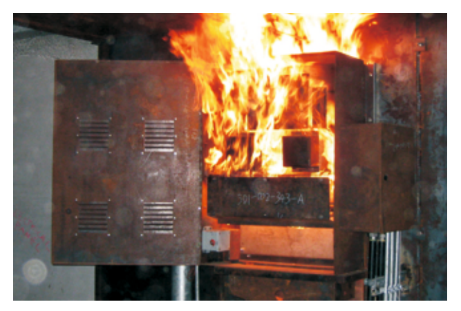
Electrical Panel Fire