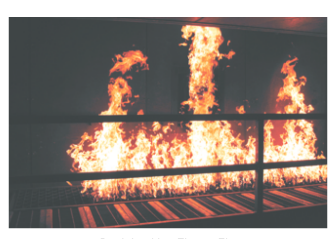
Deck Leaking Flange Fire