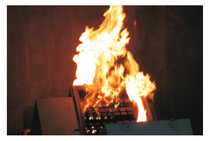
Radar Console Fire