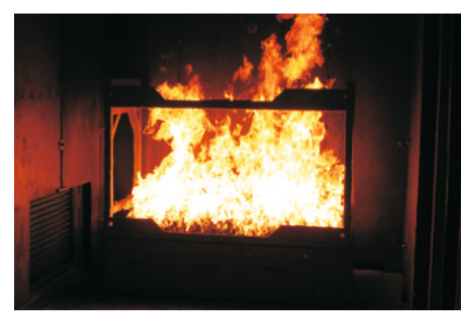
Berthing Mattress Fire