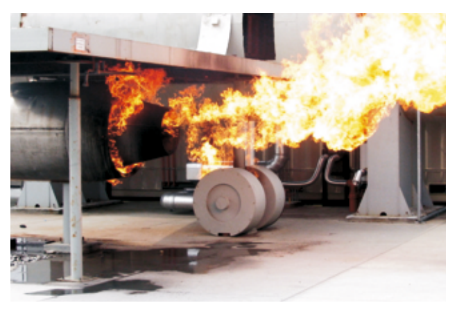
Wing Engine Fire