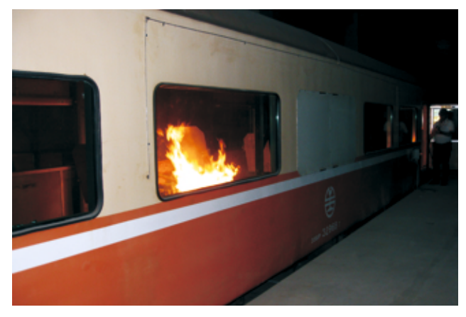
Rail Car Passenger Seat Fire