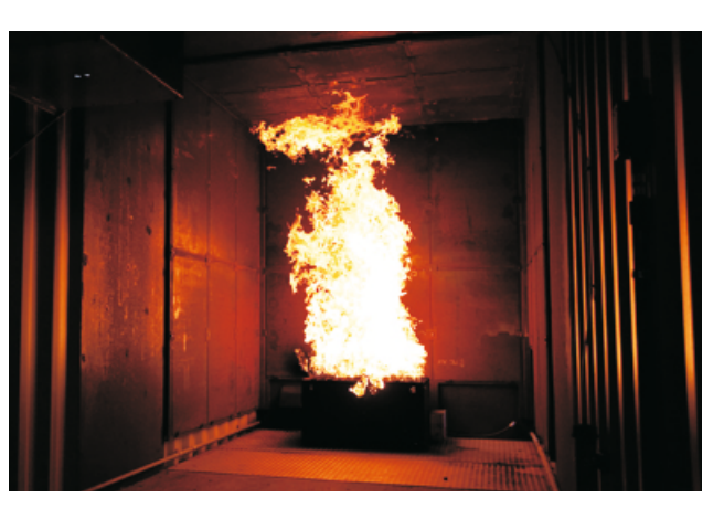
Truck Cargo Fire