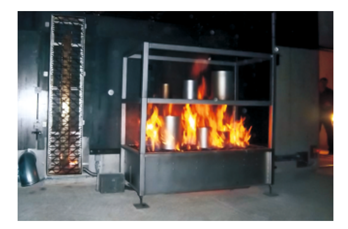
Shelf Fire Besides Inactive Cable Shaft Fireplace