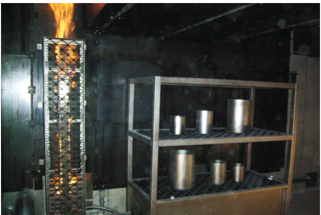
Cable Shaft Fire