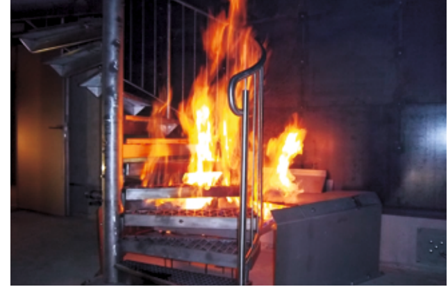
Sofa Fire Stair Fire