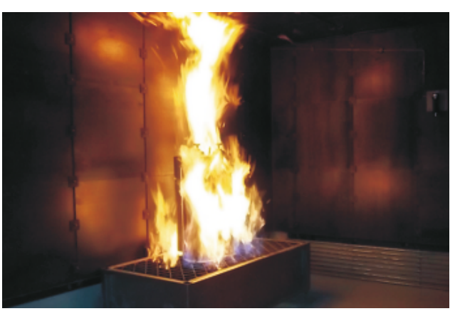
Gas Bottle Fire