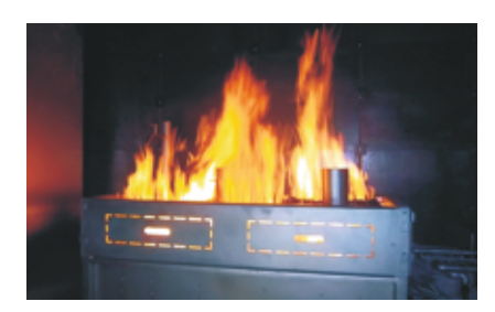
External Window Fire