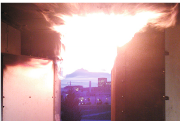
Flashover Window Fire (Indoor View)