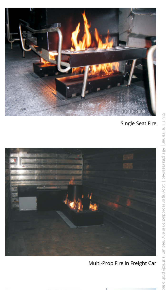
Single Seat Fire