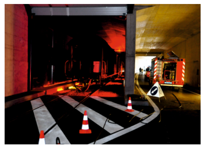
Live Training with Train Wagons

er | All rights reserved | Conving or reproduction in any medium is strictly prohibited.