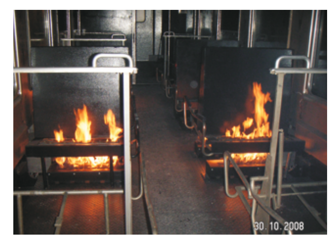
Multiple Seat Fire Scenarious