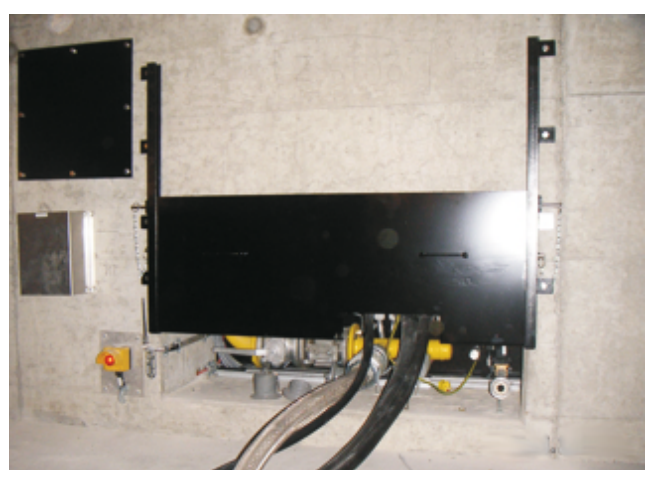
Connection Point for Gas and Power