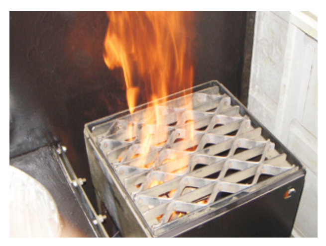
Waste Paper Basket Fire in Rest Room