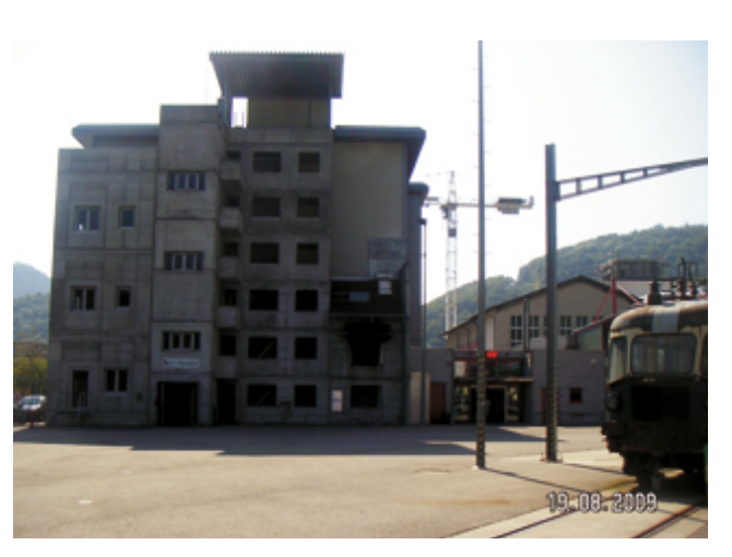
Burn House "Pyrodrome"