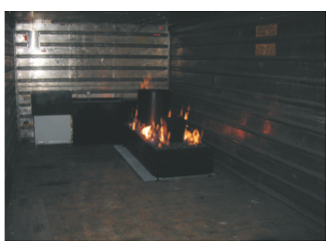
Multi-Prop Fire in Freight Car