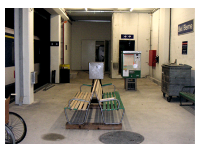
Underground Train Station Mock-Up