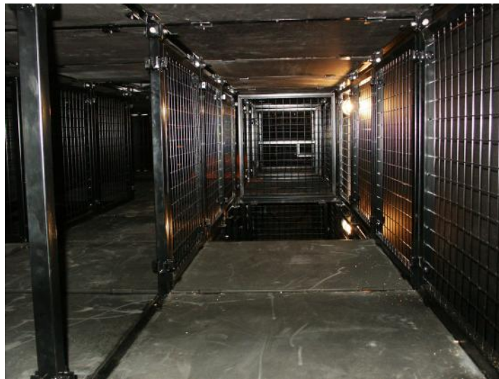
Fully Re-configurable 3D Maze