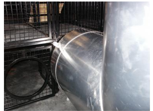
Removable Confined Space Tube Leads Directly Into Maze