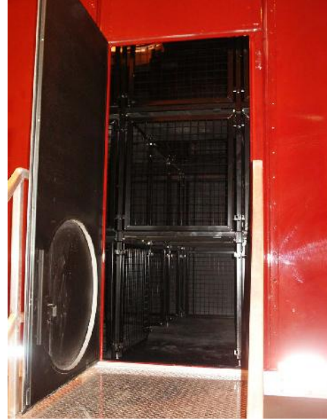
"Doggie Door" Side Entry Hatch