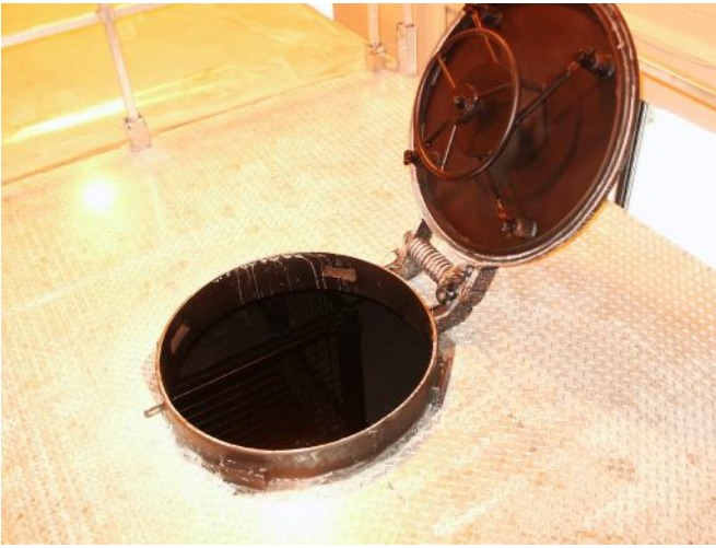
Round Scuttle Leads into 3D Maze