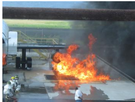
Fuel Spill Fire