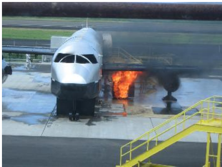
Wheel Brake Fire