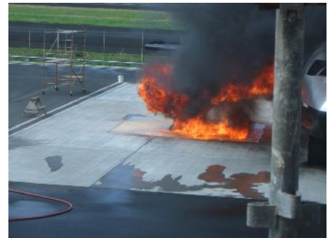
Wing Engine Fire