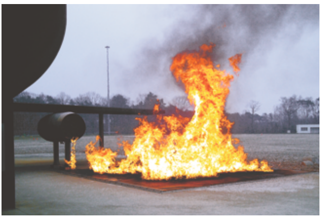
3D Fuel Spill