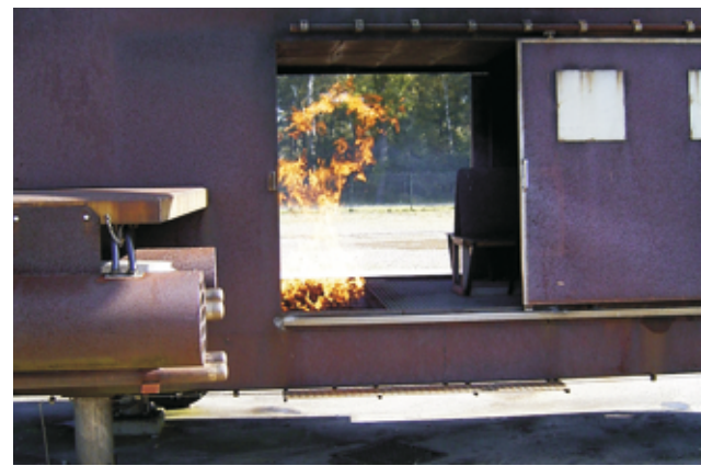
Helicopter Cabin Fire