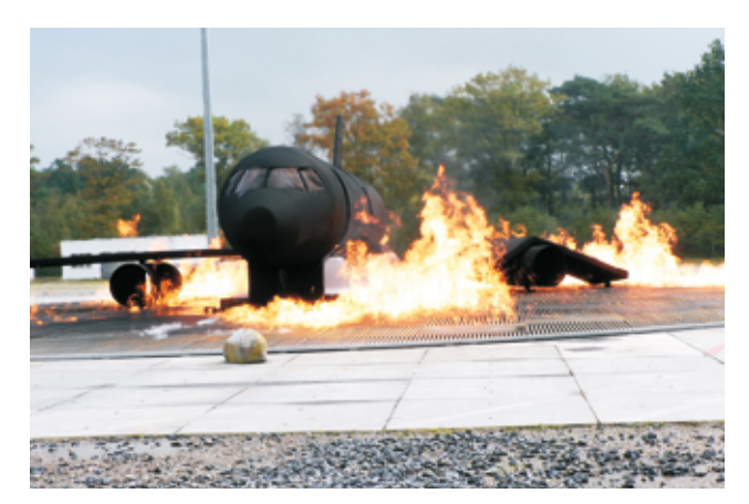
Fuel Spill Trainer: Passive Split Wing Aircraft Mock-Up