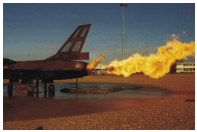
F-16 "Hot Flash" Fire