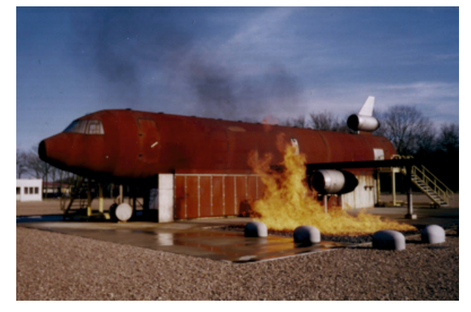
B737 Aircraft Trainer with Active Fuel Spill