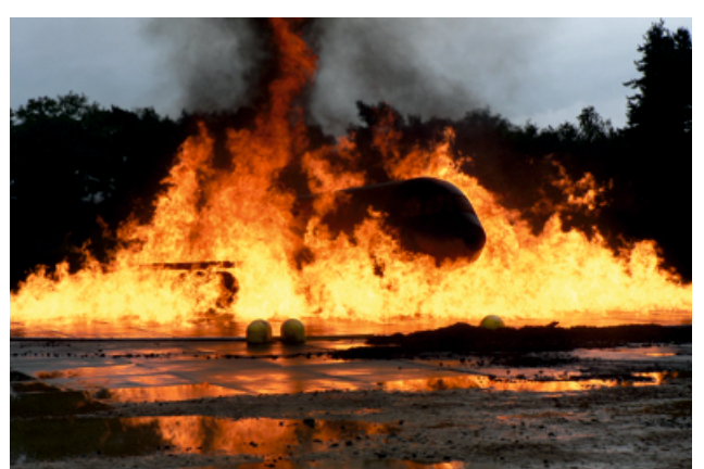
Active Fuel Spill Trainer