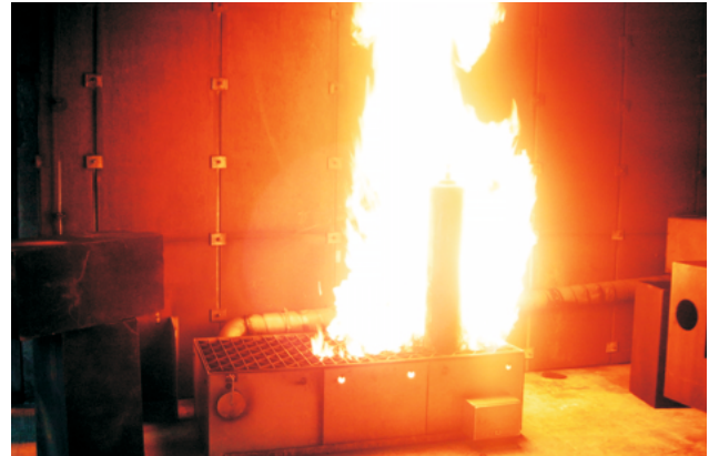
Gas Bottle Fire