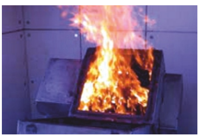
Radar Console Fire