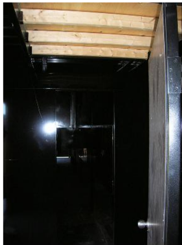
Horizontal Unit Roof Access/Chop Out Panel in Confined Space Trainer