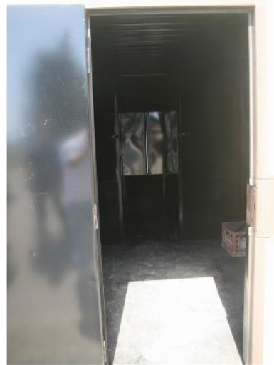
Confined Space Interior