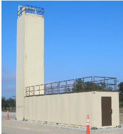
Structural FIRETRAINER® T-4000 Confined Space Trainer