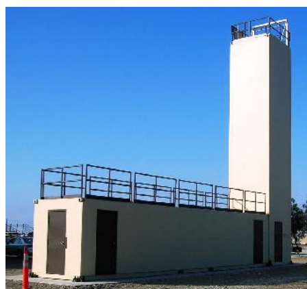
Structural FIRETRAINER® T-4000 Confined Space Trainer