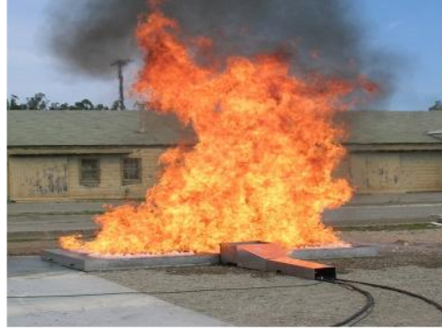
O-100 Plus Fire